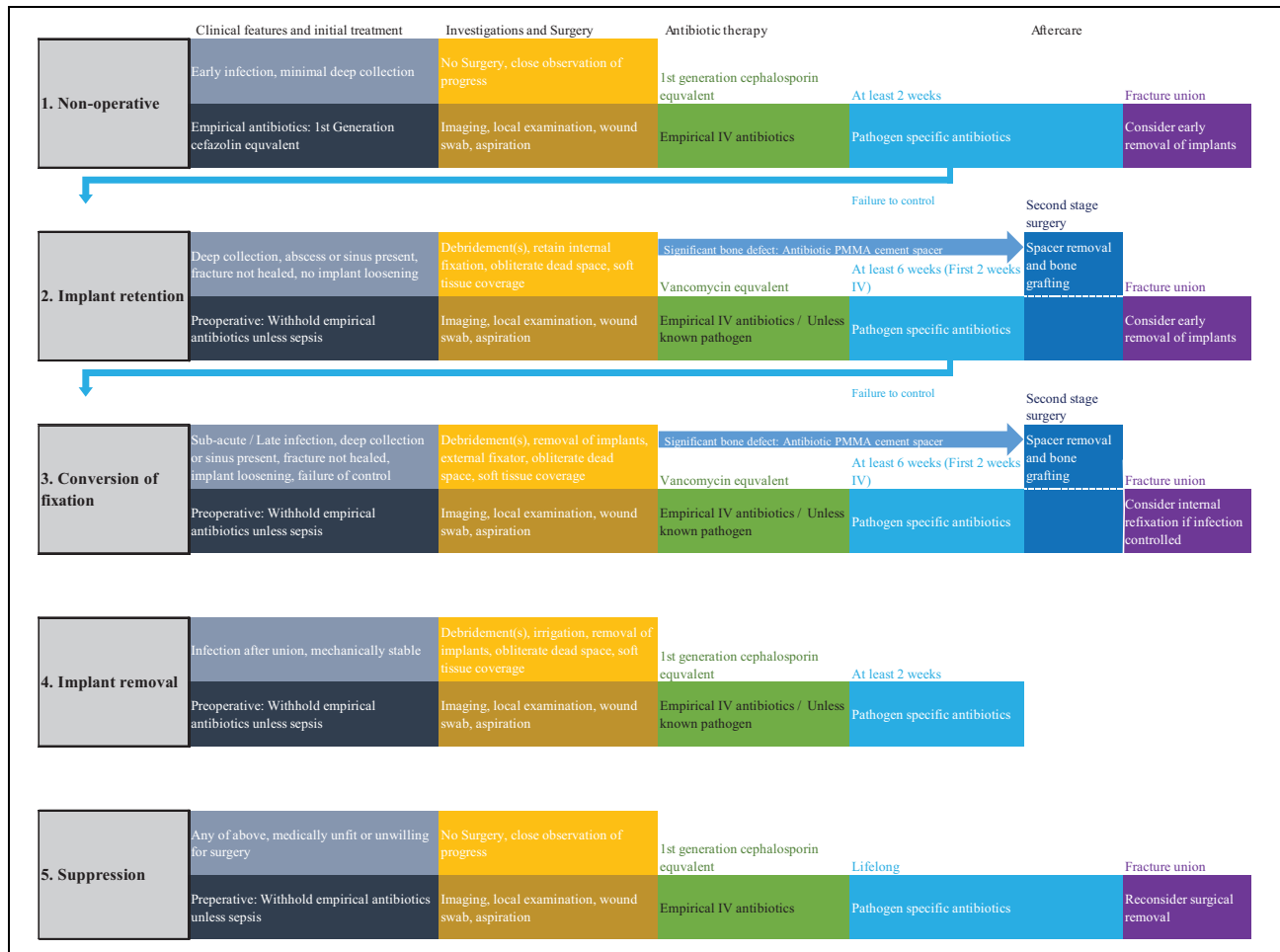
Figure 1. Outline of five different treatment pathways for OAI in different clinical situations. The management pathway should be stepped up upon failure of control from (1) non-operative treatment to (2) implant retention and lastly to (3) conversion of fixation. (4) Implant removal is performed after fracture union and (5) suppression therapy is recommended for poor surgical candidates. OAI: osteosynthesis-associated infection.

assessed for stability. Exchange of implants reduces the biofilm burden and allows for access to locations covered by the plate. Devitalized bone should be removed in severe and persistent infections even when structurally relevant. Wound lavage is performed using a large amount of normal saline. The use of antiseptics and high-flow pulsatile systems 17 is weakly supported by evidence but often performed. Sizable bone voids can be filled with antibiotic-impregnated spacers, and soft tissue defects are controlled by meticulous closure, vacuum assistance or flaps. Primary wound closure is preferred especially when there is exposed bone.