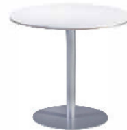
White round table Ø600