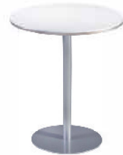
High round table Ø600