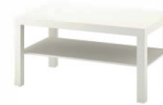
White center table 900x550x450mm