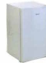
Bar fridge 500x490x830mm