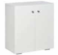
Reception desk with lockable doors 1000x500x100mm