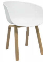
White chair with wood