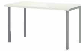
Square table 1000x600x700mm