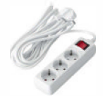
Extra multi plug adapter 1000x500x100mm